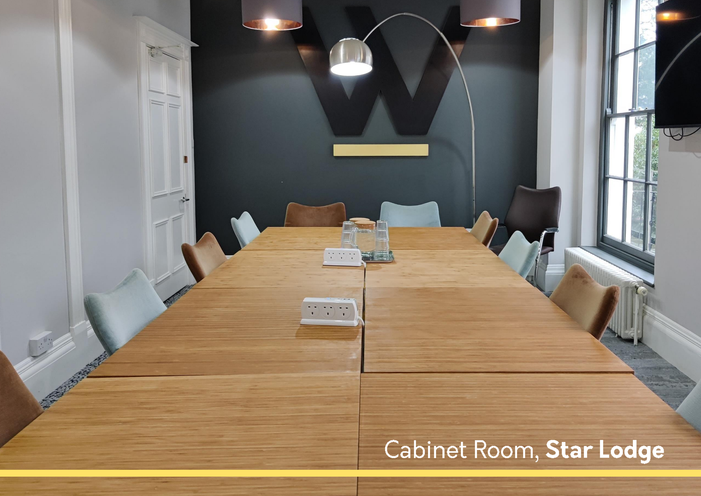
Cabinet Room, Star Lodge