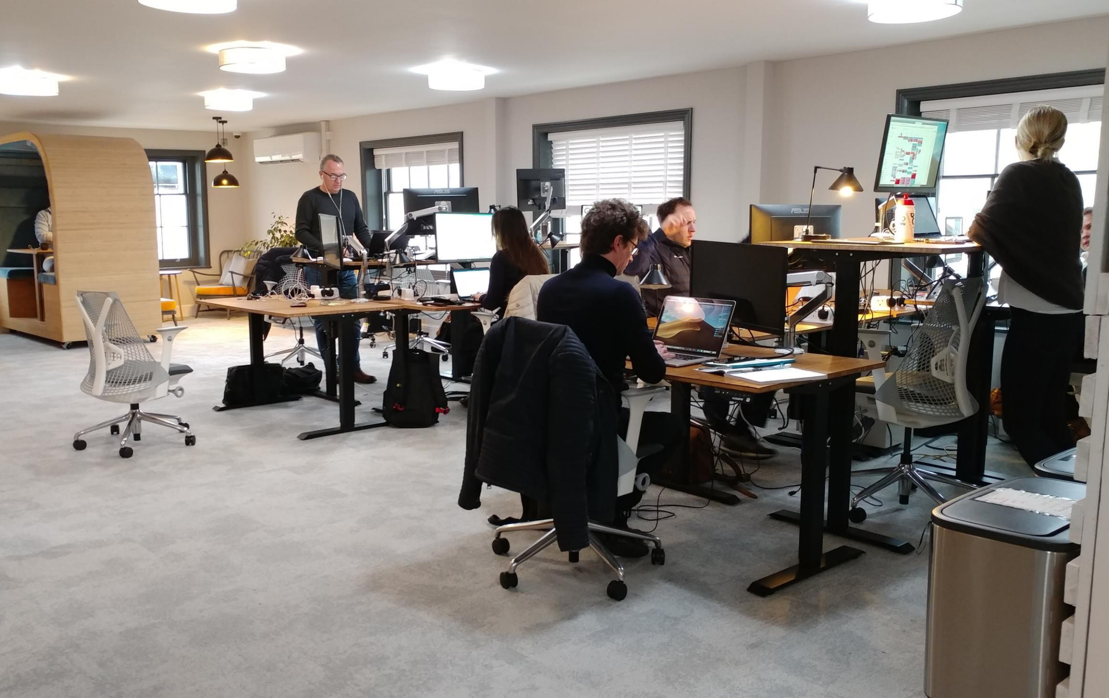
Coworking Area, Frogmore House